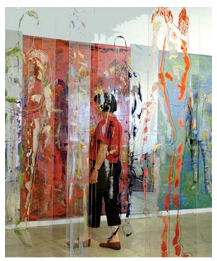
Come With Me, 2005, 8' x 25' x 15' Oil on canvas, acrylic paint on acrylic panels

Come With Me recreates alternating experiences of separation, connection, separation and connection and separation. Figures painted on hanging acrylic panels and mirrors rotate to reflect multiple transparent images, building the viewers' experience through the senses, the emotions, and conscious awareness. An a capella quartet will sing in the installation, beginning in disharmony, gradually finding each other physically and musically, and concluding in the harmony of The Coolin by Samuel Barber. Come With Me is an invitation to see, hear, feel and become conscious of the movement between isolation and community, separation and connection, in human experience.